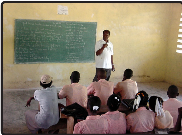
A school in Jacmel